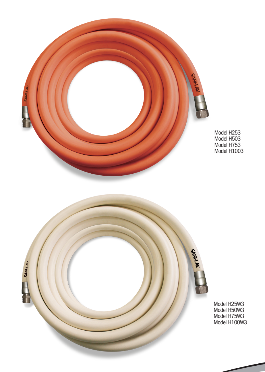
Hoses Models H253, H503, H753, H1003, H25W3, H50W3, H75W3, H100W3